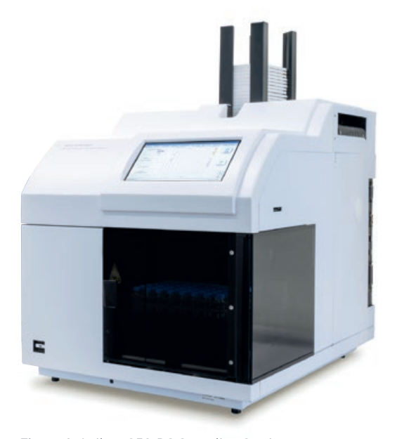
Figure 4. Agilent 850-DS Sampling Station

You may have noticed a slight change to the filter plates. This is only in name, and not in quality. GE Whatman are now called Cytiva.