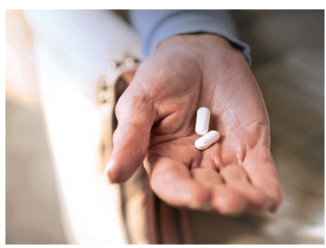
Figure 2. Drug formulations are always improving.

Automated or semi-automated approaches actually get very good utilization out of your analytical equipment, as it also allows a lot of work to be done unattended outside the normal workspan. If there are long runs that need to run for a day or two, these can be automated.