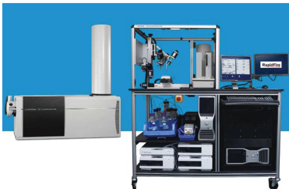
Figure 1. Agilent RapidFire High-Throughput System.

The RapidFire 360-MS system consisted of the following modules: